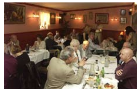
Everyone Having Fun