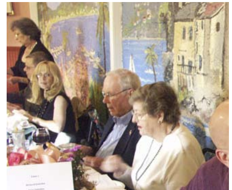
The Italian Setting