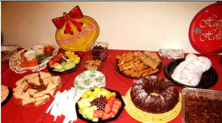
NCCC Holiday Party

Levittown Public Library, Levittown, N.Y. January 18, 2006 Volume No. 5