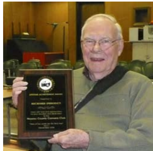
NCCC Holiday Party